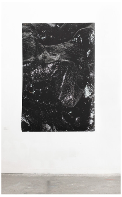
KILLA SCHUETZE *1978, Frankfurt am Main, DE Now is the time of monsters, 2023

INKJETPRINT / CLAY, RUBBER 150 × 100 CM / 9 × 9 × 9 CM STARTING BID 300 EURO