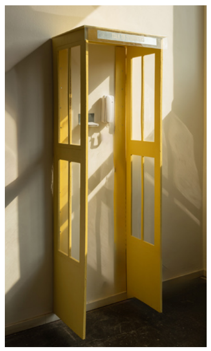
LAILA ZAIDI TOUIS *1990, Barcelona, ES Conversations with the stranger, 2021/2022

INSTALLATION, TWO PARTS APPROX. 208 × 65 × 51 CM EACH STARTING BID 500 EURO