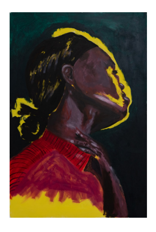
ROBERT KULET *1984, Nakuru, KE REMEMBER, 2023

ACRYLIC ON CANVAS 150 × 100 CM STARTING BID 300 EURO