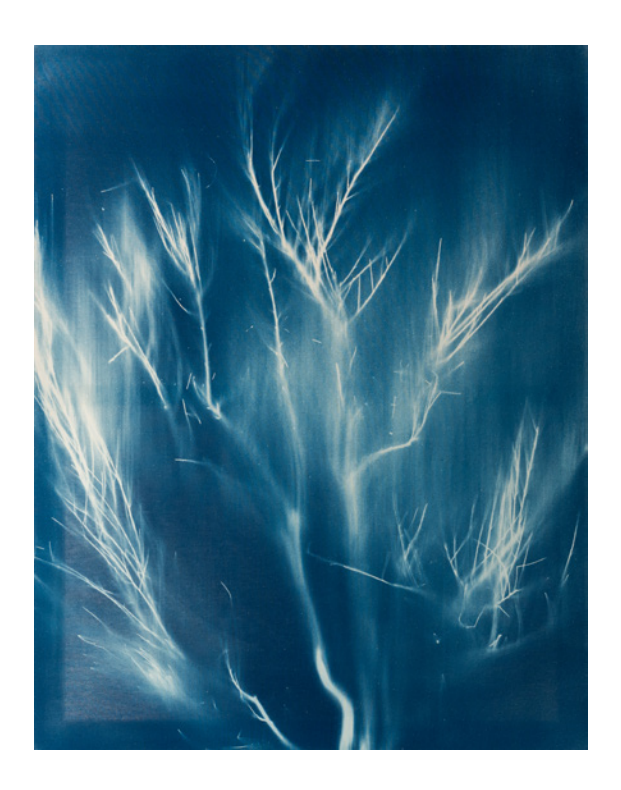
ZOÉ HOPF *1990, Kempten, DE Ginster I, 2021

CYANOTYPE ON COTTON 140 × 110 CM STARTING BID 250 EURO