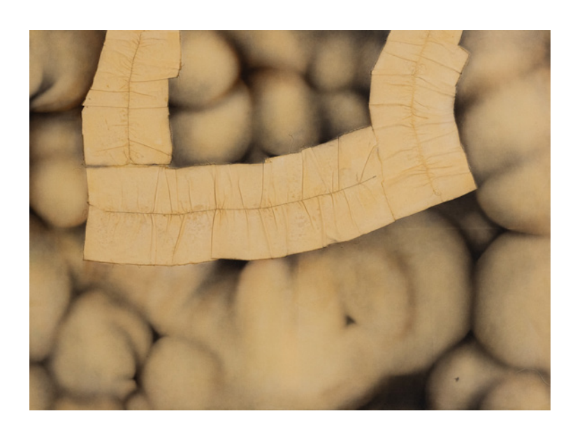
FENJA CAMBEIS *1993, Landau, DE bulldozed, 2023

ACRYLIC ON CANVAS 80 × 110 CM STARTING BID 150 EURO