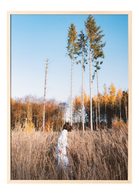
JOËLLE PIDOUX *1986, Morges, CH Fichtenflucht, 2022

PHOTOGRAPHY, FRAMED 70 × 50 CM STARTING BID 100 EURO